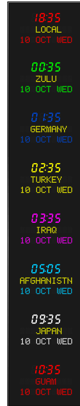
Model 30730 - 1.8" time, 1.2" zone labels, 1.2" date, 8 zones